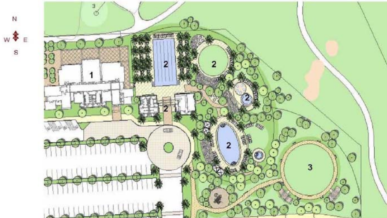
Figure B - Community & Aquatic Center Site Plan*