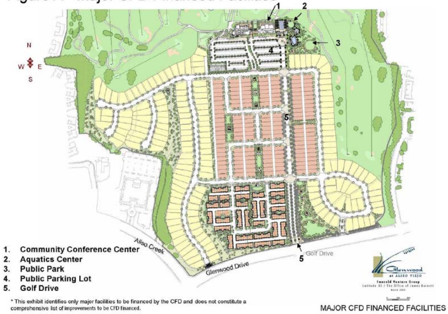
Figure A - Major CFD Financed Facilities*