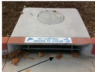
CATCH BASIN INLET

PLEASE ATTACH INVOICES OR WORK ORDERS FOR STREET SWEEPING TO THE WQMP SUBMITTAL FORM – DOCUMENTATION MUST INCLUDE TYPES AND WEIGHTS OF MATERIALS COLLECTED